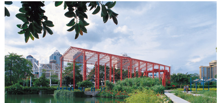
From Industry to parks top clockwise , Slides at Duisberg Nord Landschaftspark Germany, and at bottom climbing wall at Duisberg Nord, Germany, Zhongshan shipyards - China, Concrete Plant Park - New York